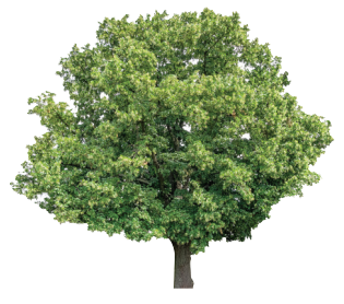
Every year, 1 large tree